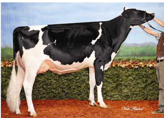
RALMA-RH MANOMAN BANJO FIFTH DAM