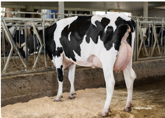
PROGENESIS FABULOUS BRISK DAM