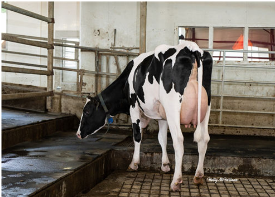
PROGENESIS FABULOUS BRISK DAM