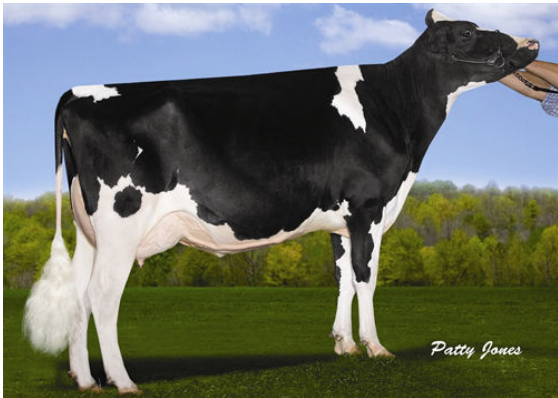
VELTHUIS SG MOM ALESIA FOURTH DAM