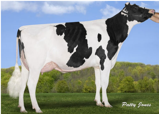
BOLDI V MOGUL AMBER THIRD DAM