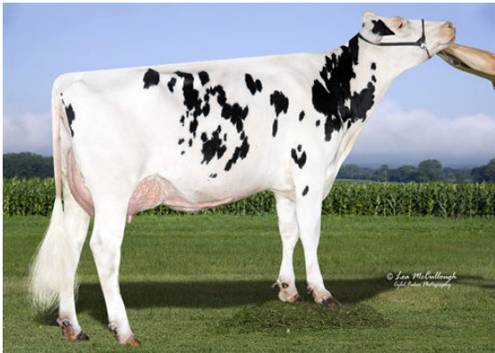
BOMAZ NUMERO UNO 5904 GRANDDAM