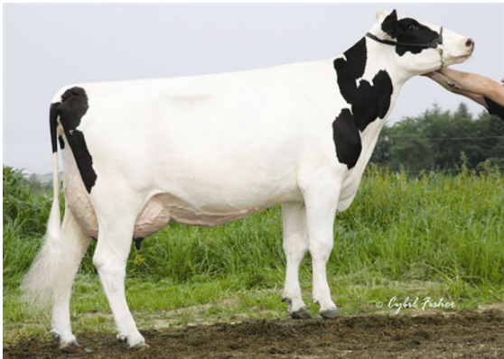
BOMAZ GARTER 2796 FIFTH DAM