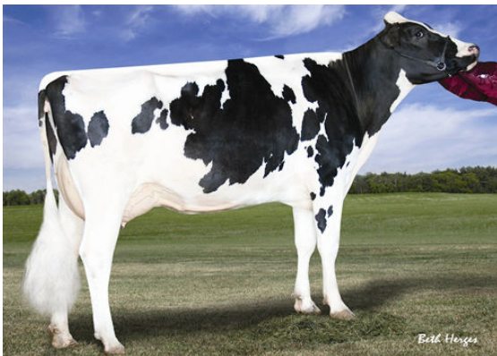
APLOUIS JET STREAM ALDA FIFTH DAM