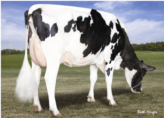
APLOUIS JET STREAM ALDA FIFTH DAM