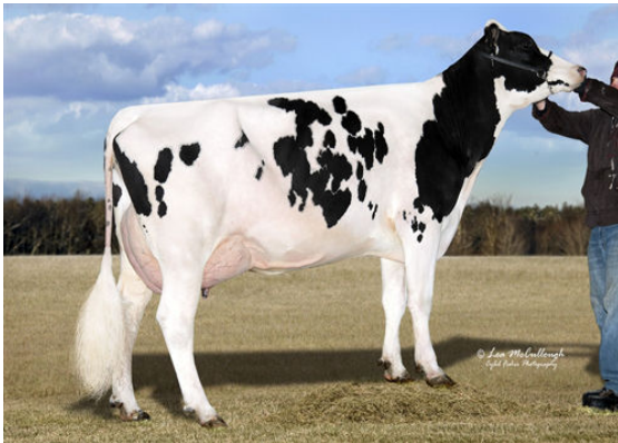
VISION-GEN SH FRD A12276 FOURTH DAM