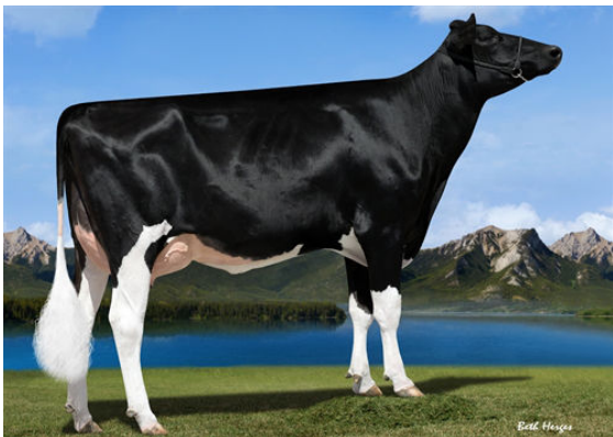
MS HUE TANGO 57644 THIRD DAM