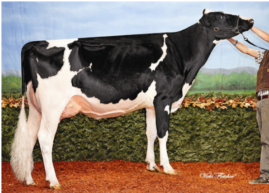
RALMA-RH MANOMAN BANJO FIFTH DAM