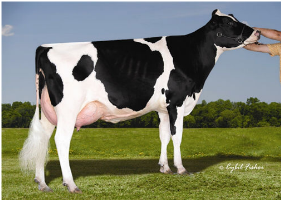
CHERRY CREST MANOMAN ROZ FIFTH DAM