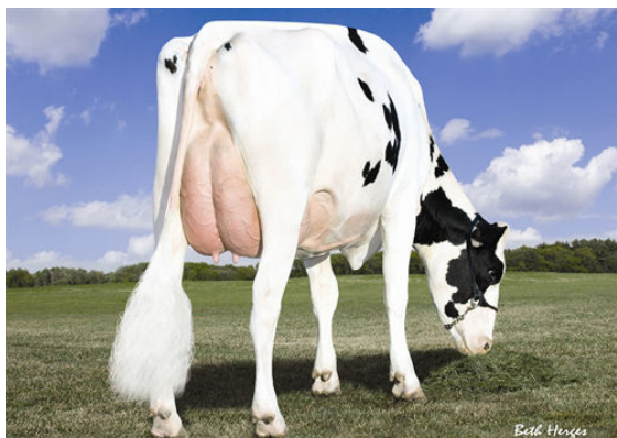
AMMON-PEACHEY SHANA FOURTH DAM