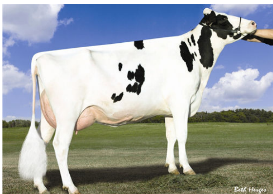
AMMON-PEACHEY SHANA FOURTH DAM