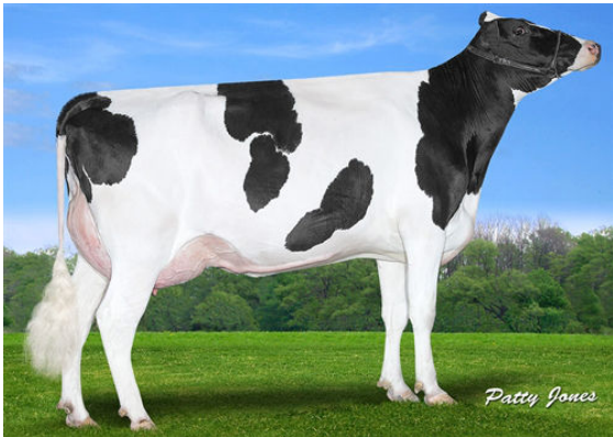
CLAYNOOK FIESTA MODESTY GRANDDAM