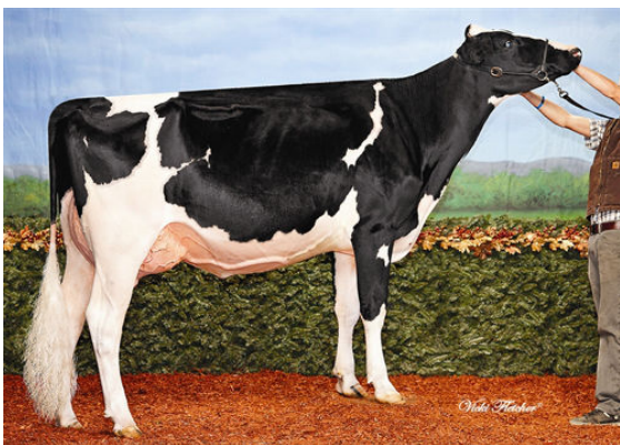
RALMA-RH MANOMAN BANJO FIFTH DAM