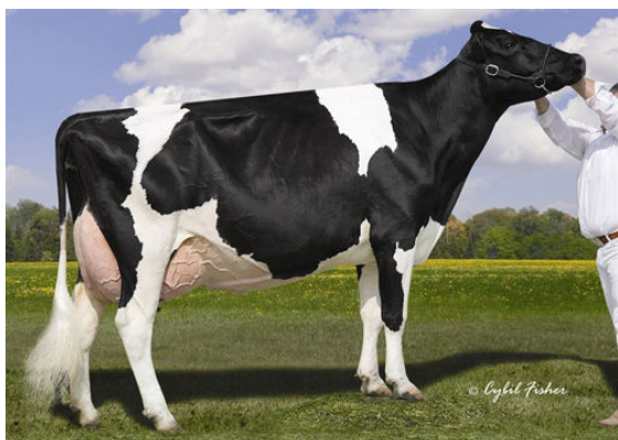
LYLEHAVEN LILA Z FIFTH DAM