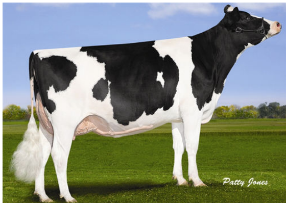
MAPEL WOOD M O M LUCY THIRD DAM