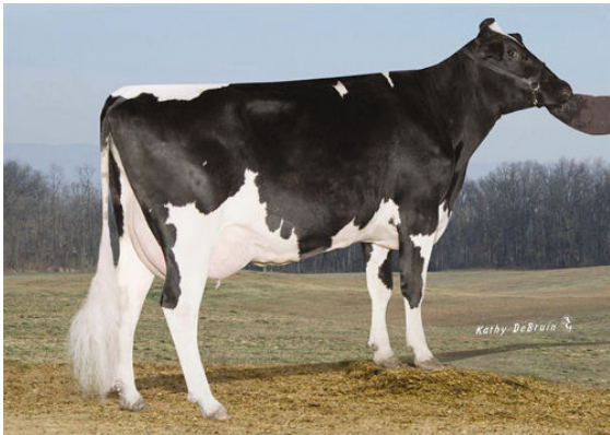
PINE-TREE MONICA SUELA FIFTH DAM