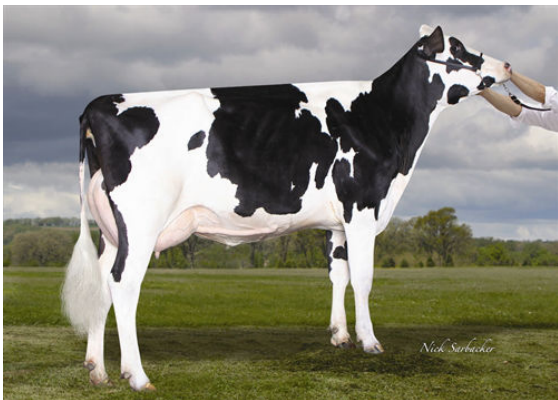
RICHMOND-FD S BARBARA THIRD DAM