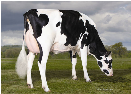
RICHMOND-FD S BARBARA THIRD DAM