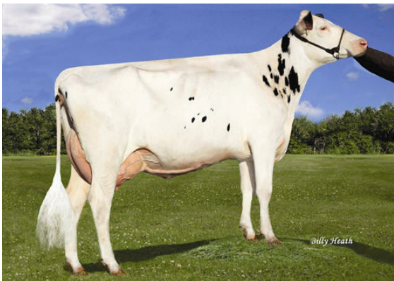
RICHMOND-FD BARBIE FOURTH DAM