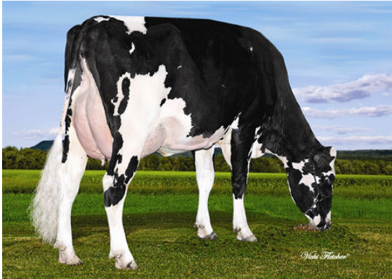
VELTHUIS SUPERSONIC ALYSSA THIRD DAM