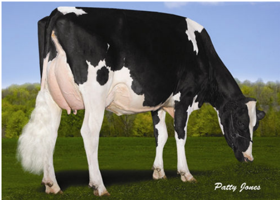
VELTHUIS SG MOM ALESIA FOURTH DAM