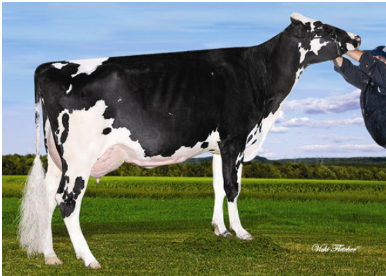
VELTHUIS SUPERSONIC ALYSSA THIRD DAM