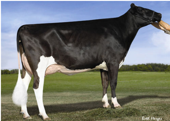
REGANCREST DGR BRYSHA FOURTH DAM