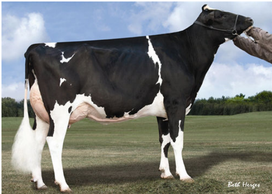
REGANCREST MAC BRESHAN FIFTH DAM