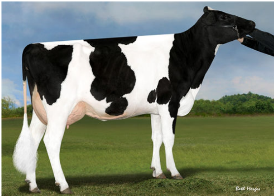
TRIPLECROWN DELTA 26 GRANDDAM