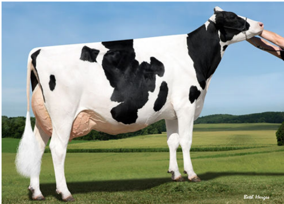
SANDY-VALLEY MG CALAMITY GRANDDAM