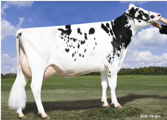
LARCREST COMET-ETS FOURTH DAM