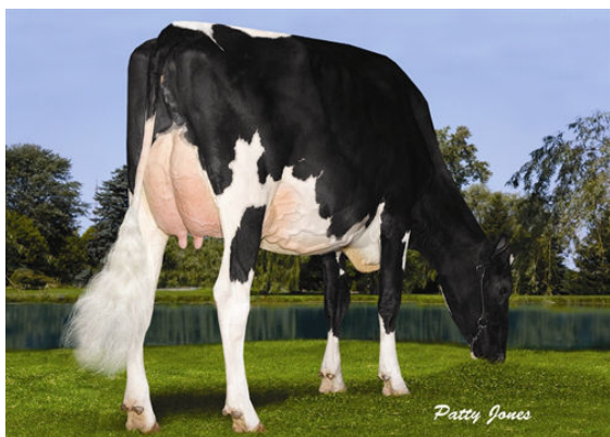
MISTY SPRINGS LAVANGUARD SUE THIRD DAM