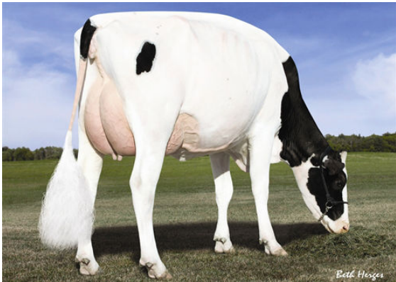
DES-Y-GEN PLANET SILK FOURTH DAM