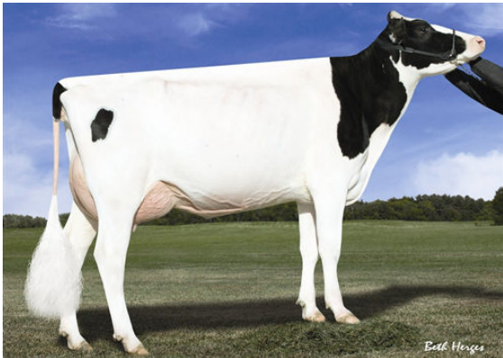
DES-Y-GEN PLANET SILK FOURTH DAM