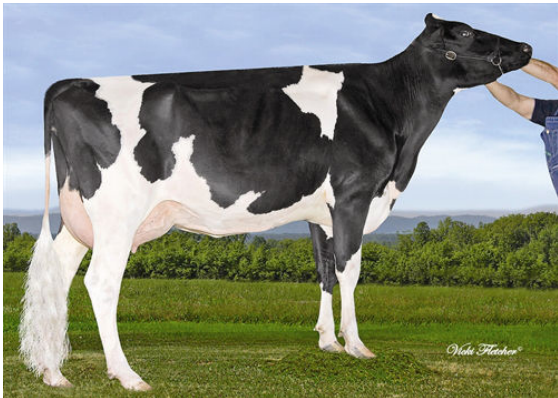
GEN-I-BEQ BOLTON SILENCE-ETS FIFTH DAM