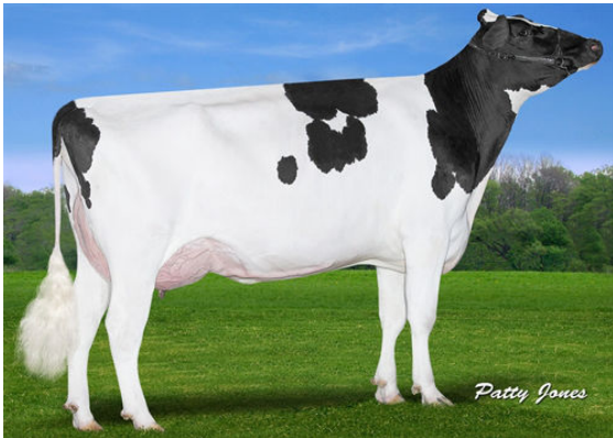
CLAYNOOK FABBY SILVER GRANDDAM