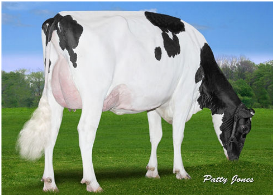
CLAYNOOK FABBY SILVER GRANDDAM