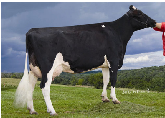
KELLERCREST TOYSTORY LADY FIFTH DAM