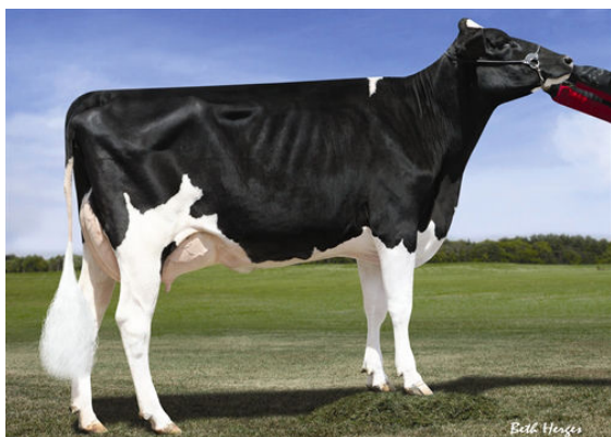
KELLERCREST MANOMAN LACY FOURTH DAM