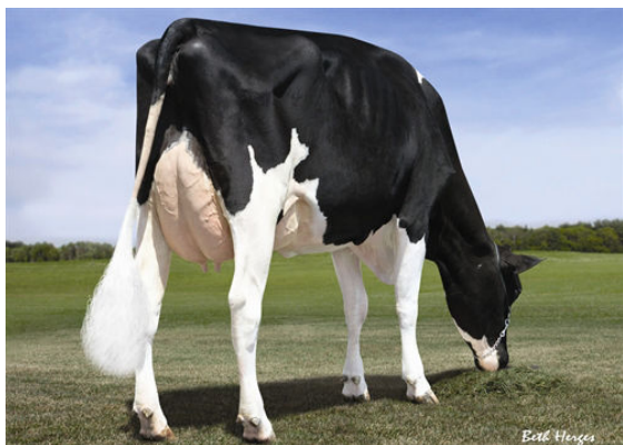
KELLERCREST MANOMAN LACY FOURTH DAM