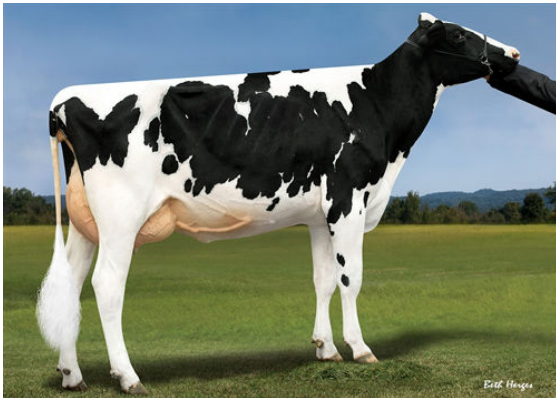
PROGENESIS JETT CATENA DAM