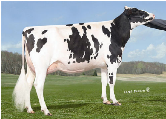
NOVA SHOTTLE EVELYN THIRD DAM