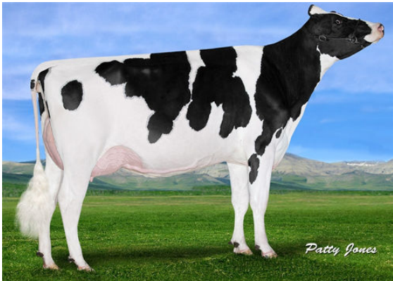
IHG JACEY GRACE GRANDDAM