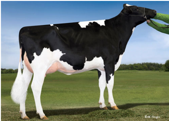
FARNEAR-TBR-BH GEORGIA THIRD DAM