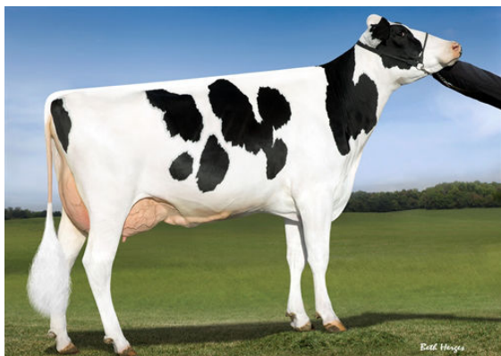
OCD SUPERSIRE 9882