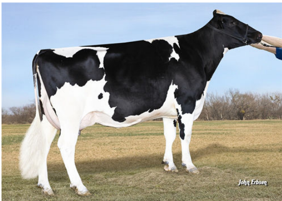
ROYLANE SHOT MINDY 2079 FOURTH DAM