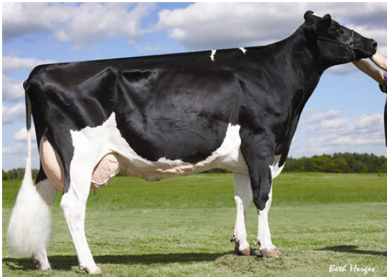
MS SULLY OMAN MUETZE FIFTH DAM