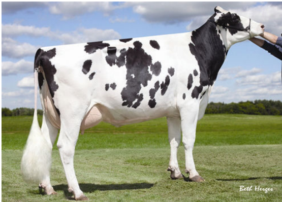
SULLY SHOTTLE MAY-TW FOURTH DAM