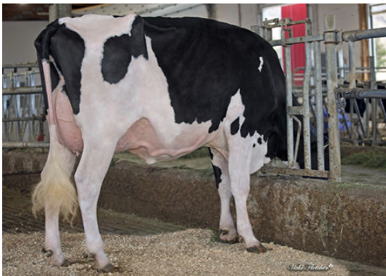
TAPPENVALE DRIFTER MERLOT DAUGHTER