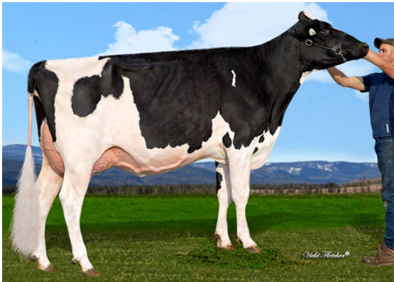
TAPPENVALE DRIFTER MERLOT DAUGHTER