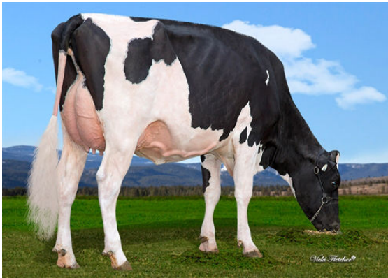
TAPPENVALE DRIFTER MERLOT DAUGHTER