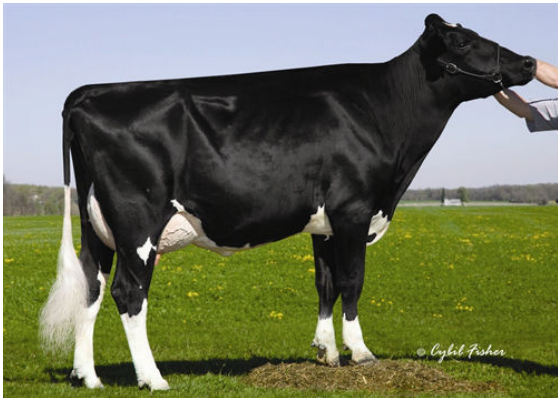
REGANCREST BRYNNA THIRD DAM