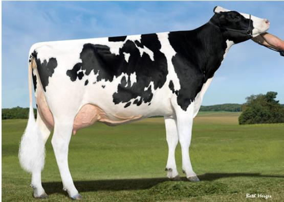
SANDY-VALLEY MORGAN ERA GRANDDAM