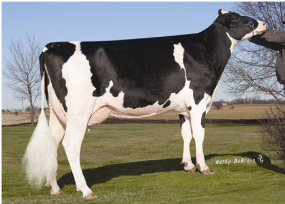
PLAYBALL MNOM BOUNTY THIRD DAM