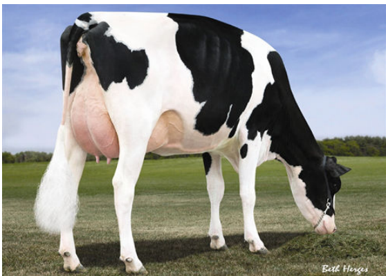
MORSAN MAN D MISSY THIRD DAM