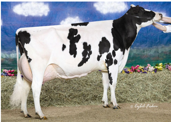
WHITTIER-FARMS OUTSIDE ROZ FIFTH DAM