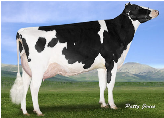
EDG RUBY UNO RIZA GRANDDAM