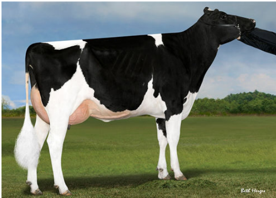
WELCOME YODER CALLO