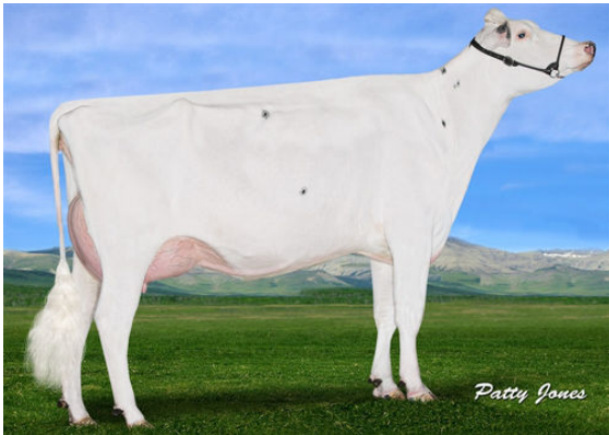
BLUE-HORIZON JCKMN BABYDUST GRANDDAM