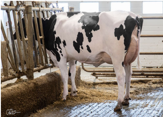
CANCO YAMASKA DREAM DAUGHTER