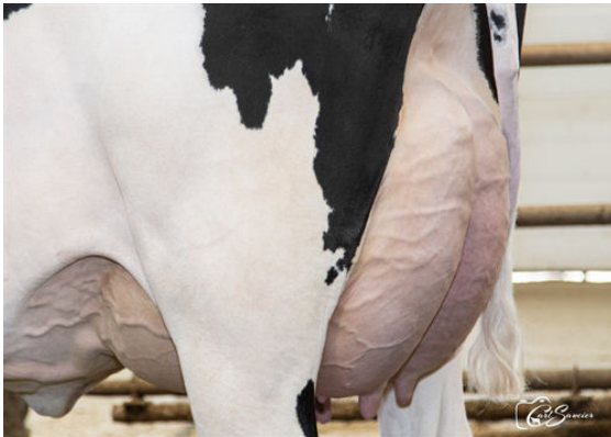
CANCO YAMASKA DREAM DAUGHTER