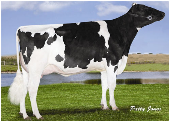
SEAGULL-BAY SSIRE DEBRA GRANDDAM