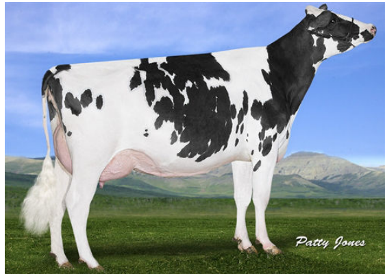
GOLD-N-OAKS MVP ARIA2815 DAM