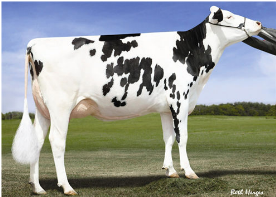
MS C-HAVEN OMAN KOOL THIRD DAM