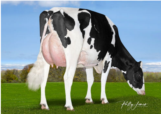
VOGUE PADAWAN ELUSIVE-P DAUGHTER