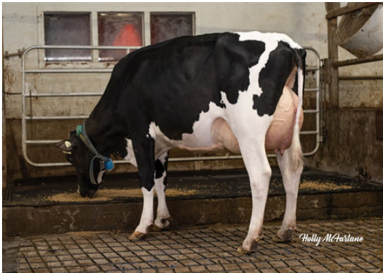
PROGENESIS PADAWAN GALLUP