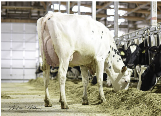
SDDOTTE BEEGEEES 4949