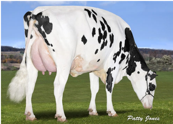
STANTONS CRAZY 4 CAMARO DAM