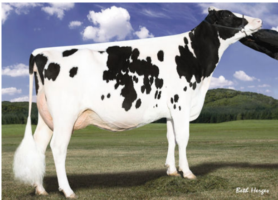
LARCREST CRIMSON FOURTH DAM