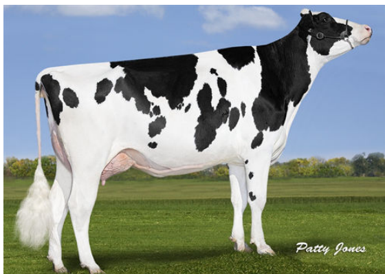
SNOWBIZ MCCUTCHEN LOTTIE DAM

ZAHBULLS 1STCLASS SNOWBIZ MCCUTCHEN LOTTIE VG-87-2YR-CAN 13* DE-SU BKM MCCUTCHEN 1174 FREUREHAVEN FGS LUCY VG-86-2YR-CAN 16* FLEVO GENETICS SNOWMAN FREUREHAVEN SHOTTLE LAUTELLA VG-89-3YR-CAN 11*