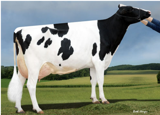
SANDY-VALLEY MORGAN CALVARY DAM