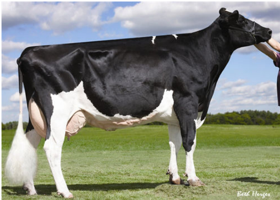
MS SULLY OMAN MUETZE FOURTH DAM