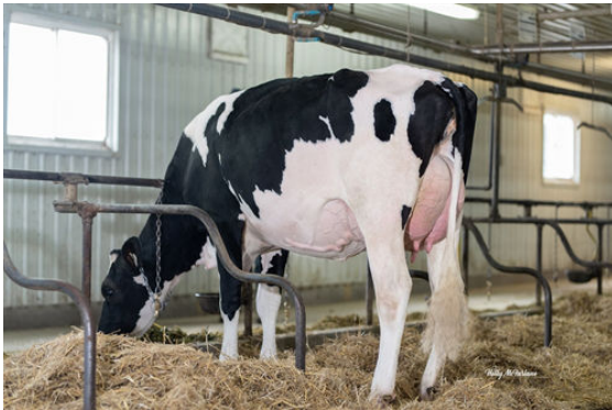
FIELDHOLME APTITUDE ALEXIS