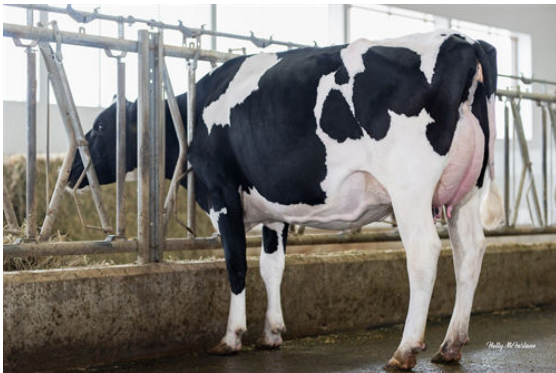
SPENCROFT APTITUDE LUCIBOMB