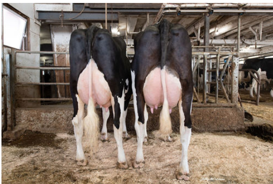
APTITUDE DAUGHTER GROUP